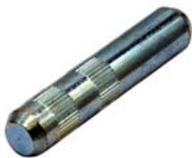
Materiale: Acciaio zincato