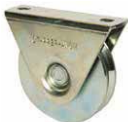
Materiale: Acciaio Zincato