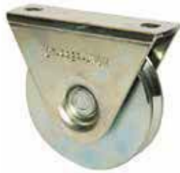
Materiale: Acciaio Zincato