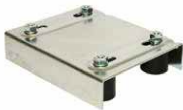
Materiale: Acciaio Zincato