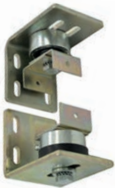
Modello depositato Materiale: Acciaio Zincato