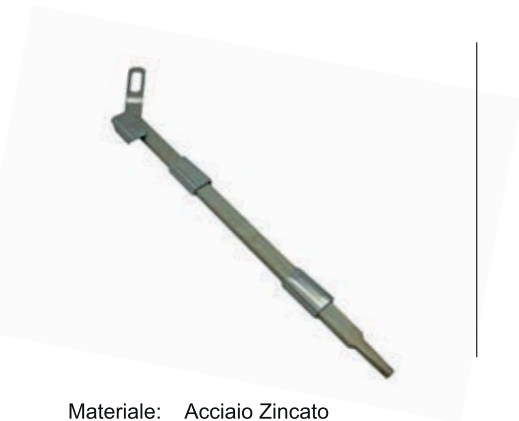
Materiale: Acciaio Zincato