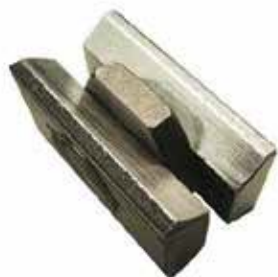
Materiale: Acciaio Zincato