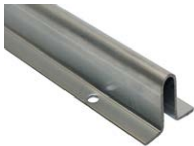
Materiale: Acciaio zincato