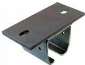
Materiale: Acciaio Zincato