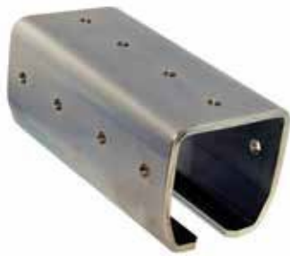
Materiale: Acciaio Zincato