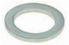
Materiale: Zincato / Ottone