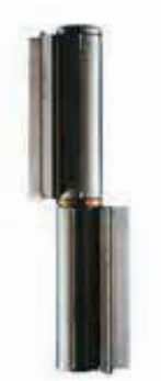
Materiale: Acciaio grezzo