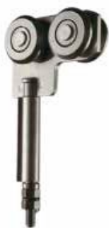
Materiale: Acciaio zincato