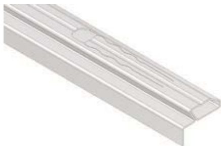
Materiale: Acciao Zincato