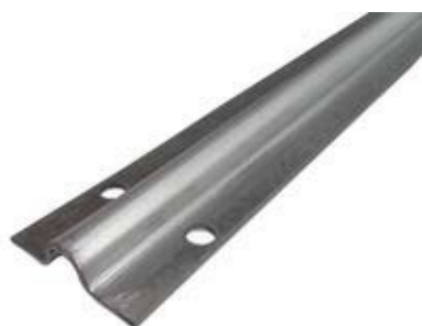
Materiale: Acciaio zincato